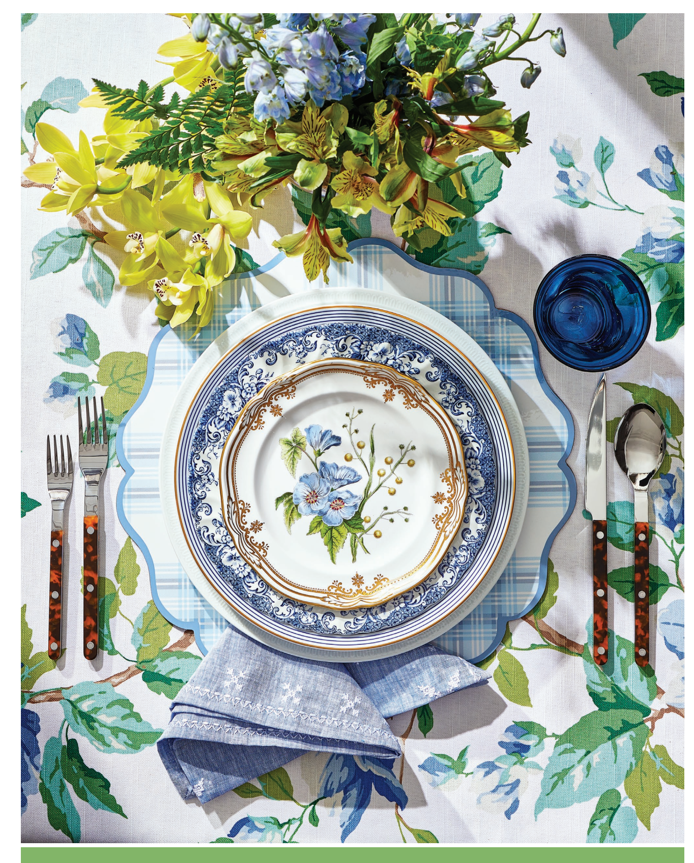
Fabricut "Bloom Season" cotton-and-linen blend floral print fabric in Larkspur. Juliska Scalloped "Tartan Chambray" blue-and-white plaid place mats. Replacements: Ceralene "Crinoline Blue" porcelain dinner plate of concentric stripes with gold edge; Johnson Brothers vintage "Coaching Scenes" scalloped, floral ceramic dinner plate; Spode "Stafford Flowers" bone china salad plate with hand-painted decoration and gold detailing. Hudson Grace "Tortoise" five-piece acrylic flatware setting and "Henri" glass tumbler in Indigo. (The hallmarks of each mouth-blown glass include air bubbles and dimples.) Kim Seybert "Fez" light blue linen napkins with Moroccan embroidery.