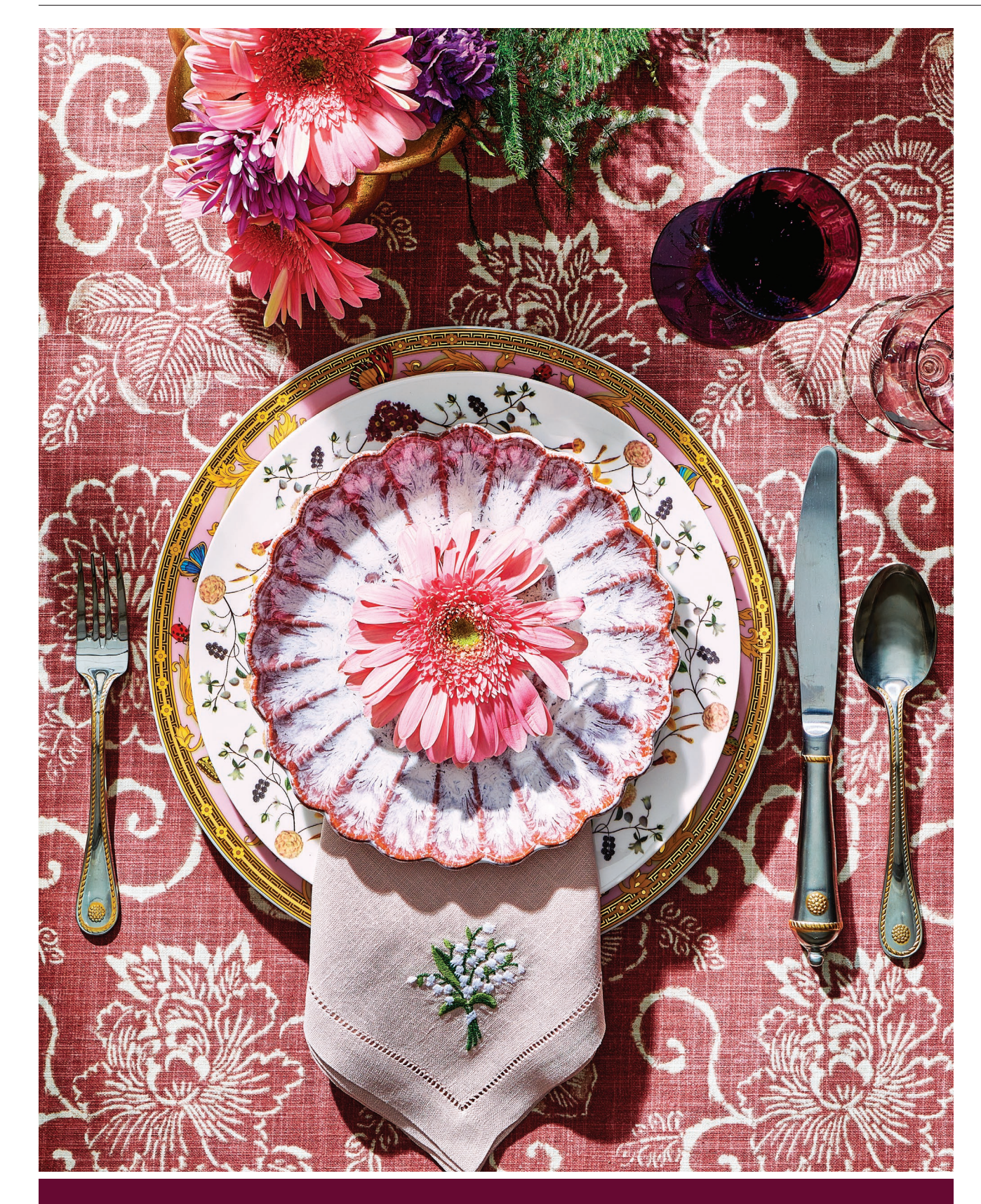
Versace for Rosenthal "Butterfly Garden" porcelain charger plate with decoration on both rim and well. Chefanie "Wedding Hydrangea" ceramic dinner plate with floral rim and "Lily of the Valley" hemstitched and hand-embroidered pink linen dinner napkin. Juliska "Berry & Thread" brushed satin-finish flatware with gold accents. Anthropologie Vintage pink-and-white ceramic salad plate with scalloped and textural detail. Kim Seybert "Daphne" mouth-blown tumbler with optical illusion design in Amethyst. Fabricut "Chaumont" two-tone floral cotton fabric in Rose Madder.