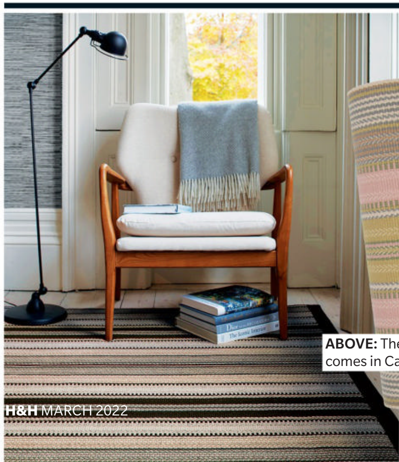
ABOVE: The updated Charleston stripe comes in Catkin, Fossil and Turkey Red.