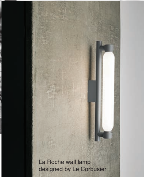
La Roche wall lamp designed by Le Corbusier