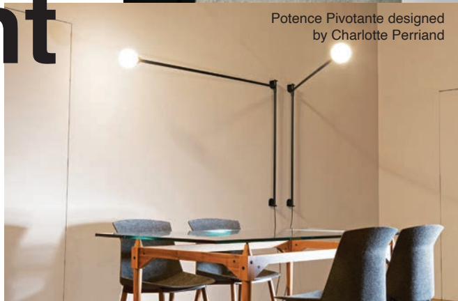
Potence Pivotante designed by Charlotte Perriand

and Charlotte Perriand . Le Corbusier is widely considered the master of the Modern architectural movement; his designs were made of up of lines and geometric color blocks, and in his view, painting, sculpture, and architecture were intertwined disciplines. La Roche was the first wall lamp designed by Le Corbusier, originally created to enlighten the large windows of Villa La Roche, a manifesto of purist architecture. The Nemo Lighting edition enhances its lightness and functionality via a matte metal frame with opal glass diffuser for soft lighting. Le Corbusier designed the Projecteur for the Chandigarh High Court of India in 1954. The painted aluminum body comes in three