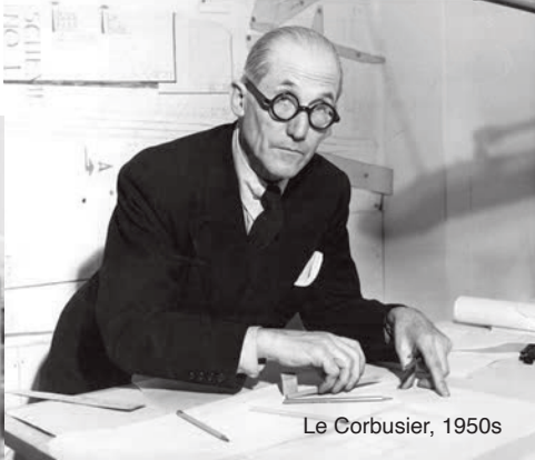
Le Corbusier, 1950s