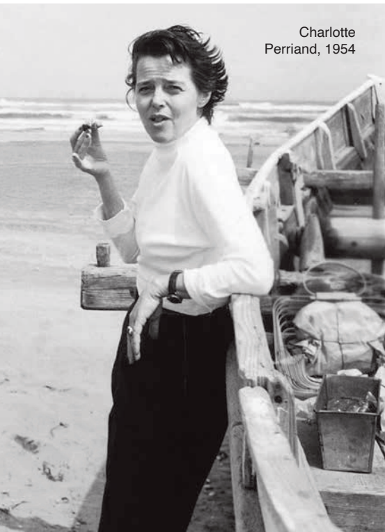
Charlotte Perriand, 1954